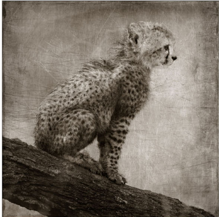
UNDER A DARK SKY – WILD LIFE PHOTOGRAPHY BY ROBBY BOLLEYN 26 October – 21 December 2013 • Eduard Planting Gallery in Amsterdam

For more than 15 years Belgian photographer Robby Bolleyn has travelled in Tanzania to capture the wildlife in his own special way. 'Under a dark sky' shows magical and graceful portraits of African animals. The exhibition is from 26 October until 21 December 2013 in Eduard Planting Gallery in Amsterdam.