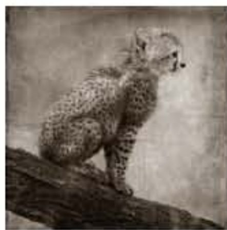
Alone on this earth