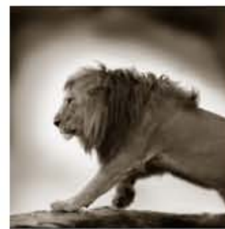
On patrol (detail)